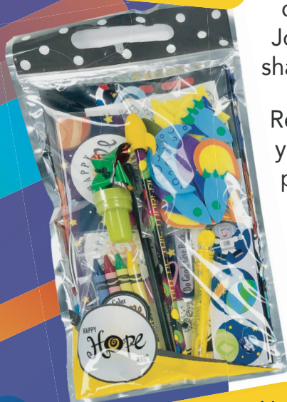
Sample overnight kit

Gather your family and share your GIFT – and a boost of hope!