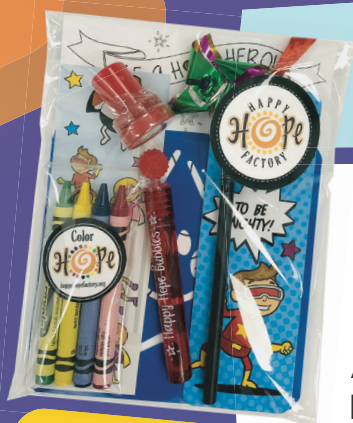
Sample outpatient kit

For more information, visit happyhopefactory.org or email info@happyhopefactory.org to be added to the interest list.